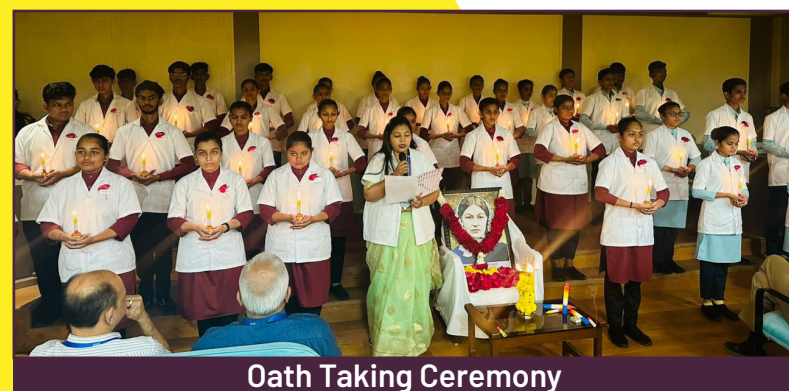
Oath Taking Ceremony